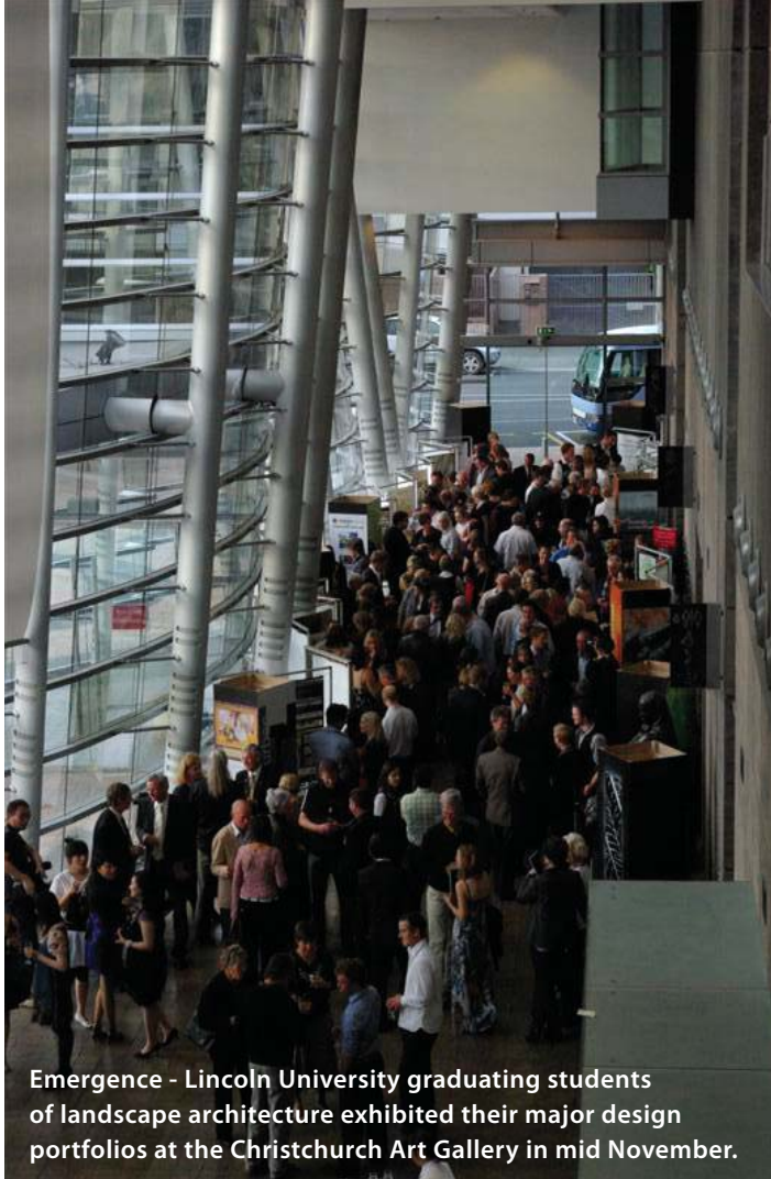
Emergence - Lincoln University graduating students of landscape architecture exhibited their major design portfolios at the Christchurch Art Gallery in mid November.

Over the coming year, we are devoting an area of the newsletter for branch members to profile inspiring places/projects. If you wish to share a photo, sketch, or image, please email jpgs to emma.content@opus.co.nz. Photos of places you've been on your summer travels, details of paving etc. If it's inspiring, we'll use it.