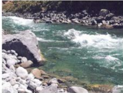
Natural character rating: 85% Key attributes: clear water, swift flow, natural channel