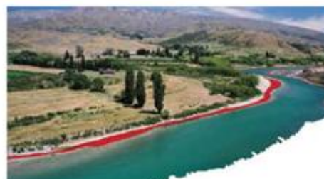
Fig 12: The wetted surface area changes significantly with a reduction of flow in single thread rivers with shelving banks, which makes differences in flow more detectable than in rivers with steep banks.