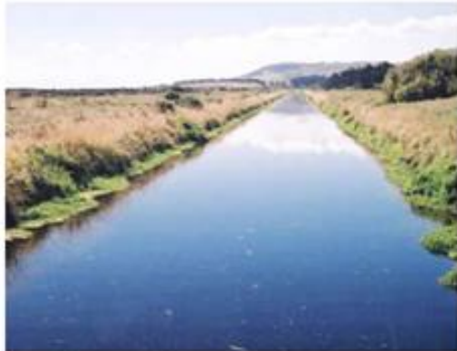
Natural character rating: 12% Key attributes: modified cross/ long section, stock access