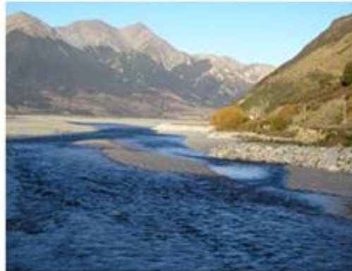
Natural character rating: 70% Key attributes: localised bank modification, natural context