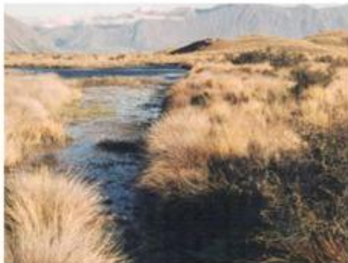
Natural character rating: 95% Key attributes: unmodified wetland and landscape context, native plant species