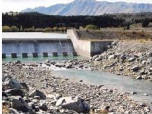
Natural character rating: 10% Key attributes: flow modification, man-made structure