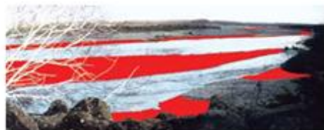
Fig 11: Flow changes in braided rivers are often difficult to detect due to the highly dynamic nature of the channel and their wide river bed.