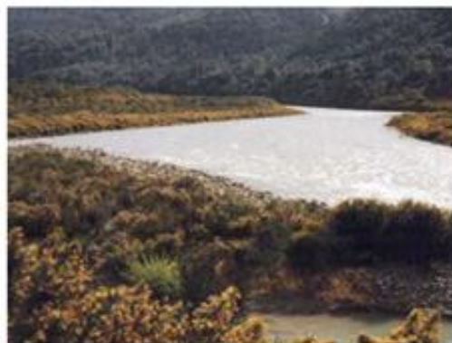
Natural character rating: 60% Key attributes: weed infestation on banks, native vegetation in landscape context